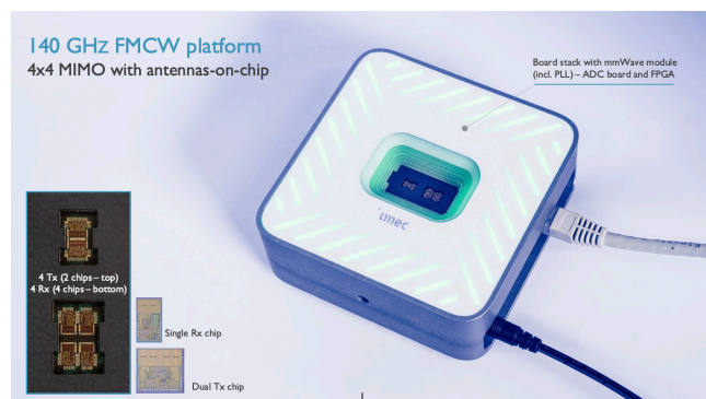
Imec's 140 GHz radar demo platform